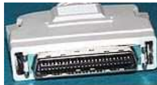
HPCN50 pin (rare)

Used in Japan, on several Digital cameras and things.